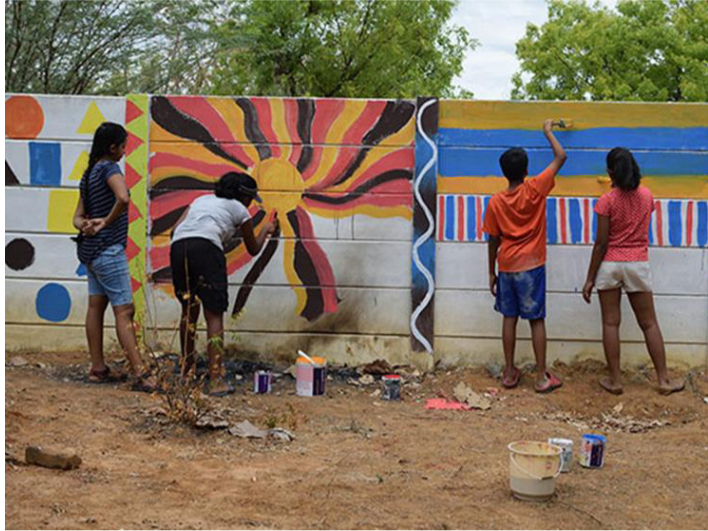
Children creating artwork on boundary walls