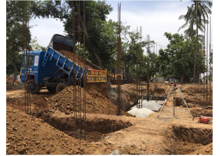
Foundation and Footings