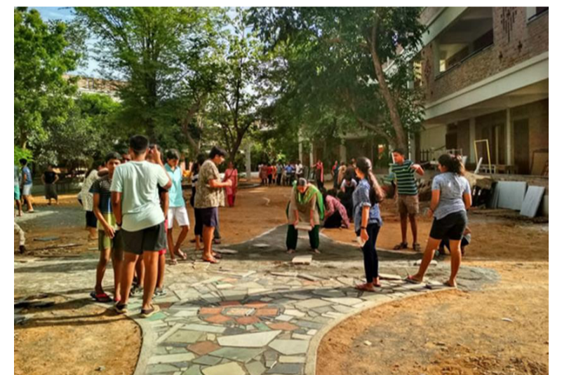
Children help build pathways using construction waste