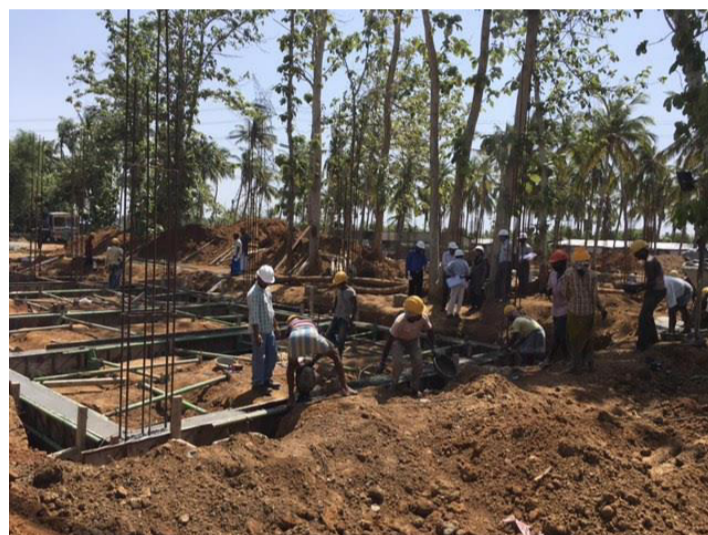
Casting of plinth beams: Staff Room