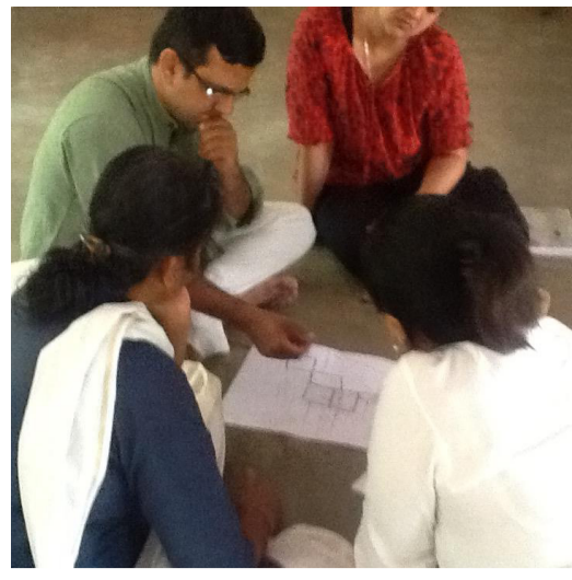
Planning the buildings - A collaborative effort involving all stakeholders