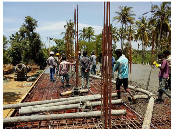
Preparing to cast roof slab