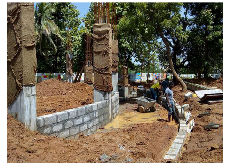
Raising of columns: Library