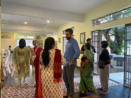
January 5th and 6th Alumni Get-together