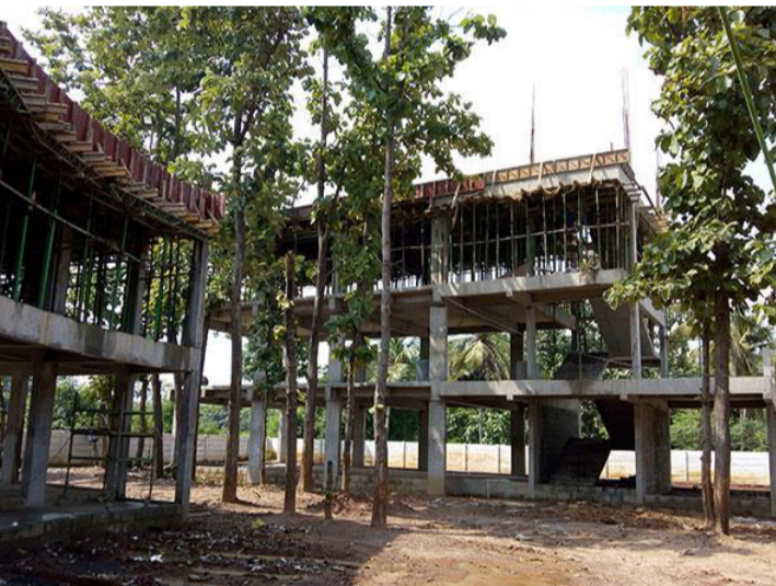
Staff Room and Senior School