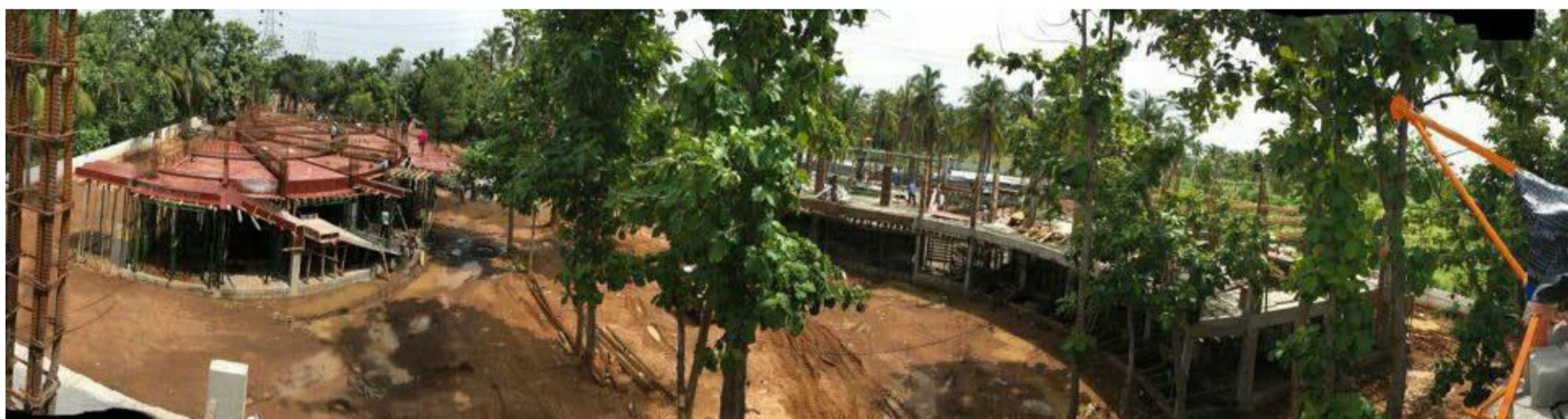
An aerial view of the ongoing construction- Assembly Hall and Junior school