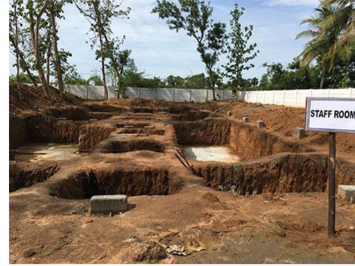
Start of marking and excavation