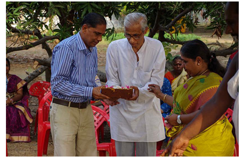
Ground breaking ceremony