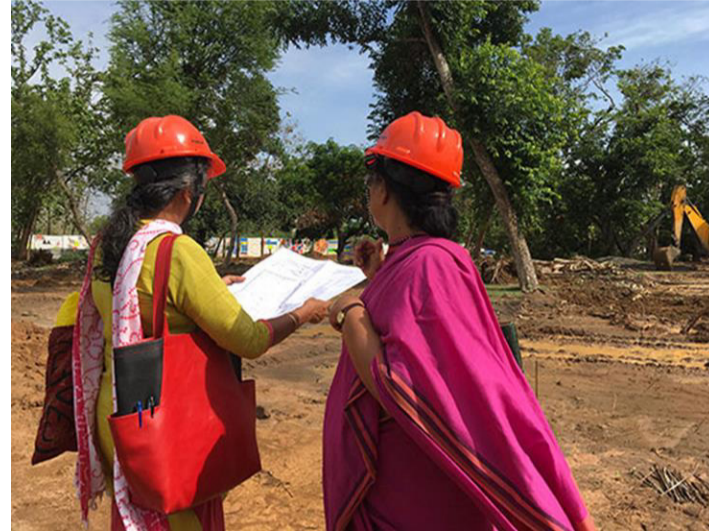
Teachers taking active part in the construction