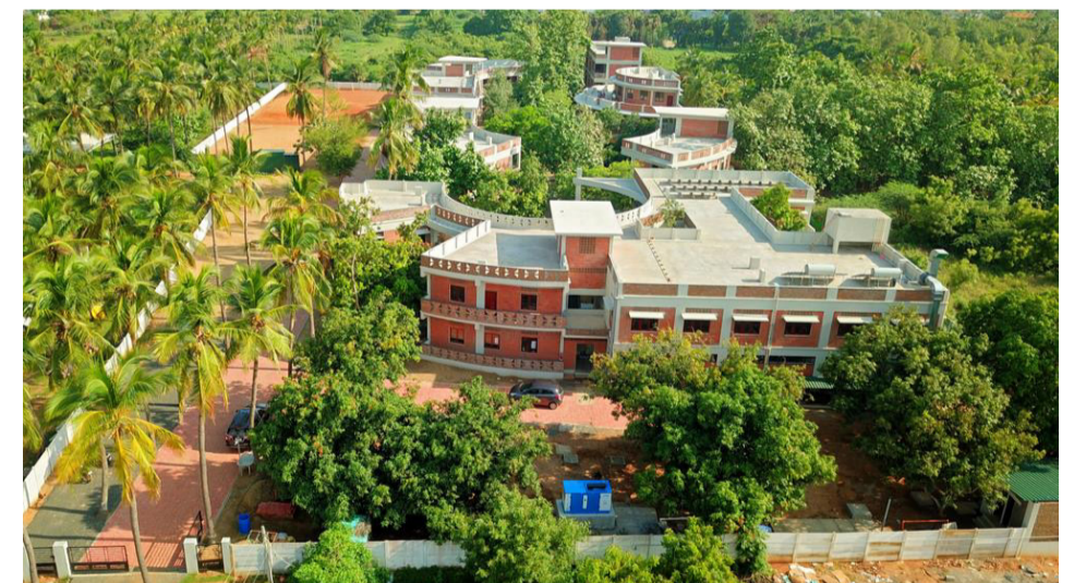
The buildings seamlessly weave around the existing 76 trees