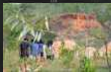
Class X – Trip to Anroville