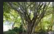
A Slice of Life at School