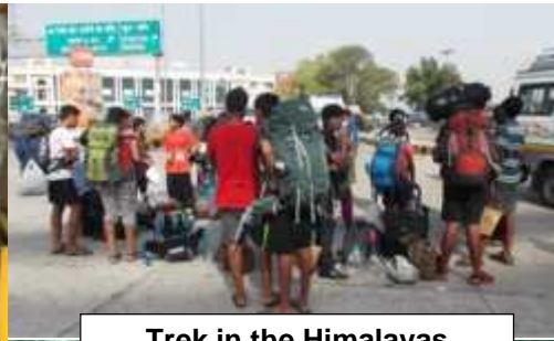
Trek in the Himalayas