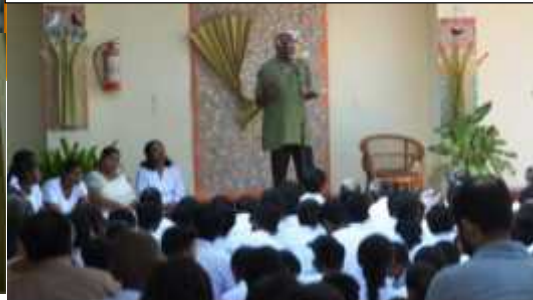
A special dance theatre production for the guests from all the Krishnamurti Foundations