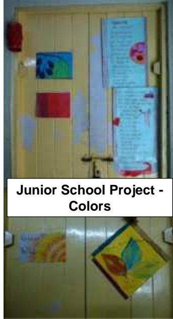
Junior School Project - Colors