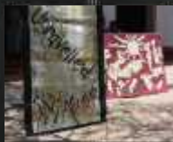
Drama Fest 2015

It has been over two years since we restarted The Newsletter from the school. In the issues we have brought to you in these two years, we have tried to give you a peek into the life at The School through events, stories, interviews and reports. As a refreshing departure from the earlier format of the newsletter, this issue comes to you in the form of a photo album; we decided to let the pictures speak. We welcome you to “The Photo-Letter” of the academic year 2015-16.