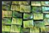
Class XI – Trip to Wardha