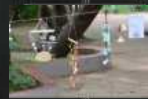
Middle School Project Day